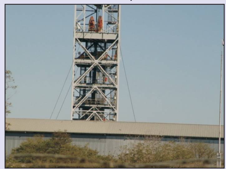
"Mines should assist in the alleviation of poverty within communities", so said one concerned resident at an Imbizo in Sekhukhune District