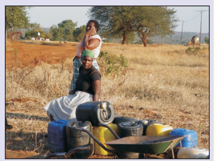
Water headache! "Water, water and water everywhere, but not even a drop to drink"