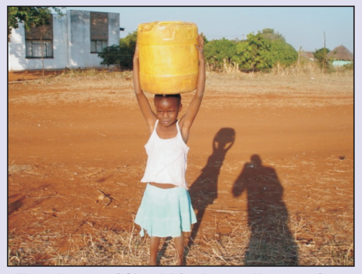
"I am the rose of Giyani, I fetch water 2km away from home everyday after school hours".

Mgxaji indicated that the provincial economic growth rate is currently estimated at about 4.1 percent which is less than the national rate at 5.1 percent. The provincial economy showed an upward during 2006 and slowed down in 2007. This was due to the tightening of the monetary policy and the increase in interest rates by the South African Reserve Bank. This, therefore, reduced the production rate as the consumer demand was low. The growth achieved by the province is derived from the performance of