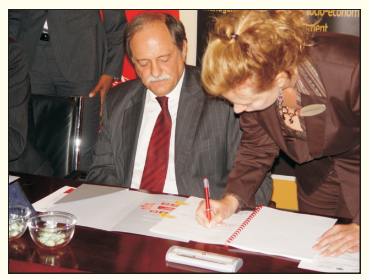
"As ABSA, our commitment to service delivery for the people is unquestionable"

"Together we will deliver for our people", the three seem to be saying.