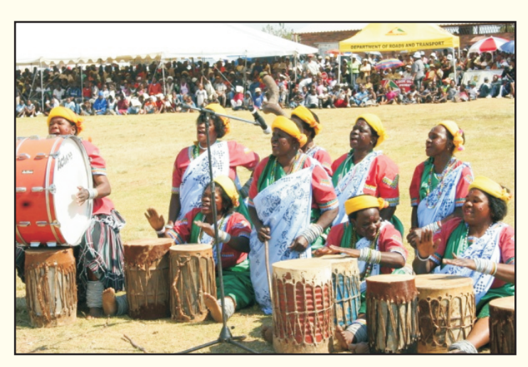
Dancing to the music of freedom!

The Premier stressed that government is committed to the vision of continuing to improve the lives of the people and that through knowledge and skills, especially in the field of technology, our nation can survive in a globalised world which is manipulated through the use of computers.