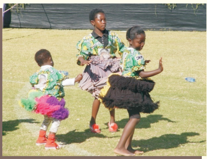
Teka! teka! teka!!!