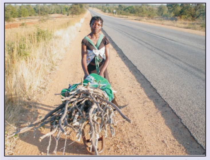
"Times are tough and hard, I travel 3km a day to fetch wood", says a lady in Giyani

The province maintains a high unequal distribution of income, with a Gini Coefficient that ranges up to 0.7112. This unequal distribution of income is accompanied by high levels of poverty in the province which is estimated at about 60 percent.