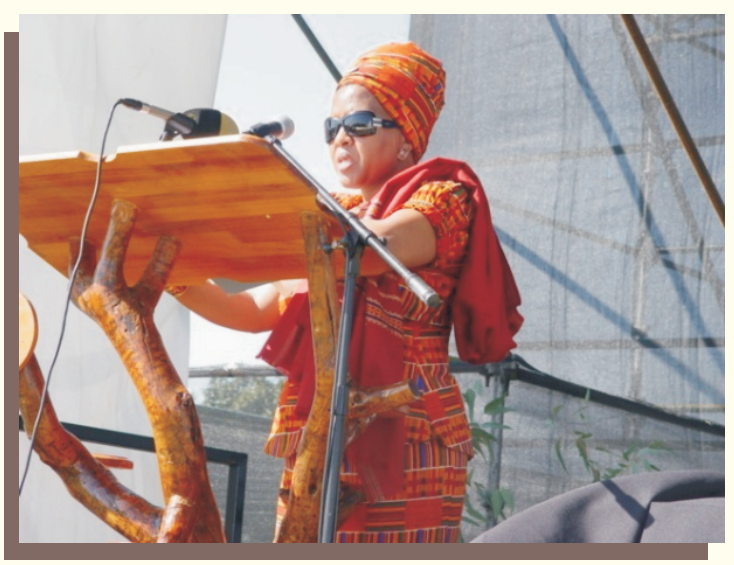
Voter education being given to the youth.