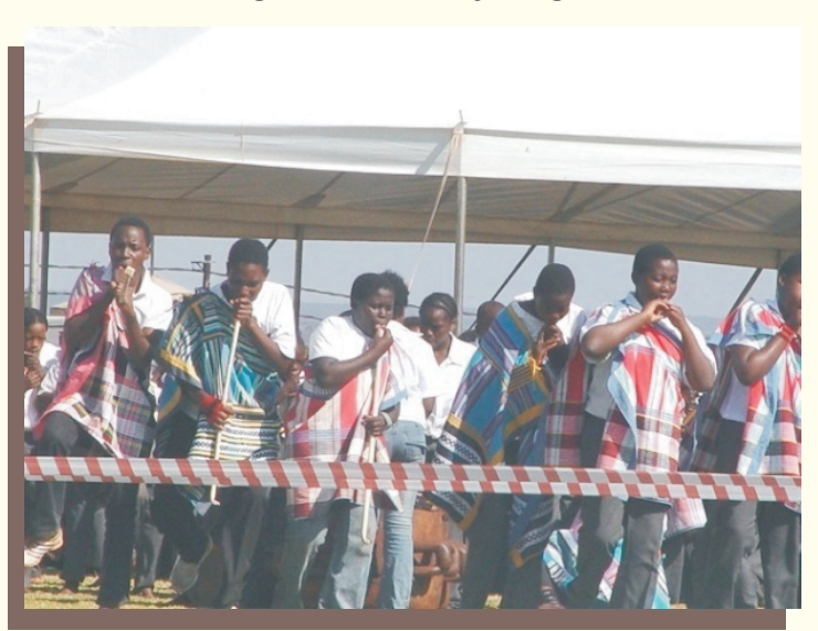
Music was born in Africa, the cradle of humanity!