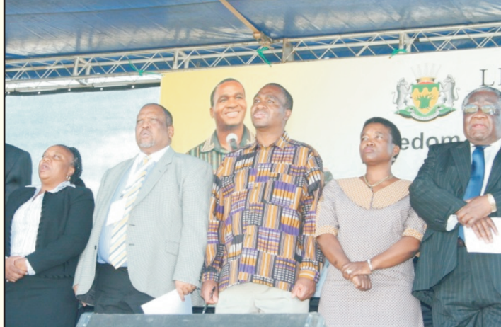
The Singing of the National Anthem at the Freedom Day Celebration in Bela-bela

Among the dignitaries who graced the occasion were, National minister for the department of Sports and Recreation, Rev. Makhenkhesi Stofile, National Deputy