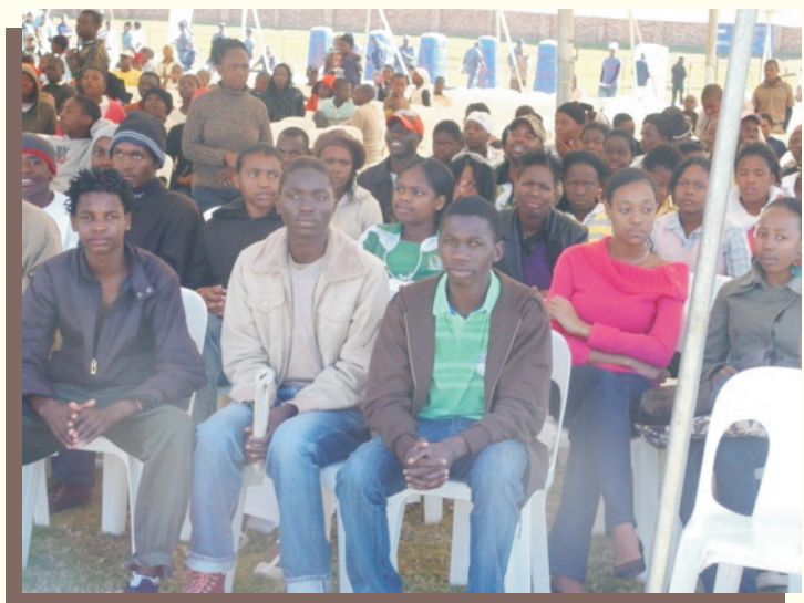
"We hear you Honourable Premier"