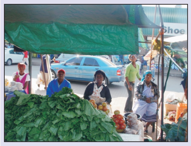
Vegetable vendors trying to make a living in Malamulele

Mgxaji also indicated that the exports performance of Limpopo has increased steadily since 2000. The province has accounted for 6 percent share of total exports. These are in the sectors of mining, basic chemicals, basic iron and steel; mad machinery and equipment. This was due to weaker Rand/US dollar exchange rate. When the Rand/US dollar depreciates the demand for South African exports rises because they become cheap in the international market. Mining products constitute approximately 75% of total value of Limpopo's exports.